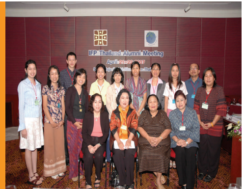
Above: Ford IFP Thailand Alumni Network Meeting Attendees pose for a group picture at their April 2007 alumni meeting in Khon Kaen, Thailand. The meeting was an opportunity for alumni to recommit themselves to serving the poorest communities in Thailand.