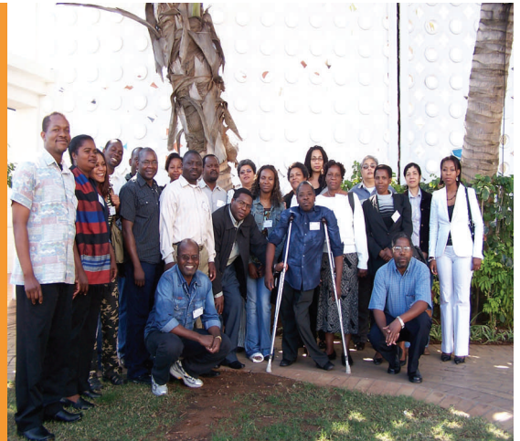
Above: Ford IFP Mozambique Alumni Network Meeting Attendees pose for a picture at their August 2007 alumni meeting in Maputo, Mozambique.