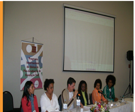
Above: Ford IFP Brazil Alumni Network launch “Education,” the first of a four-volume compilation that considers various aspects of social activism in Brazilian society.